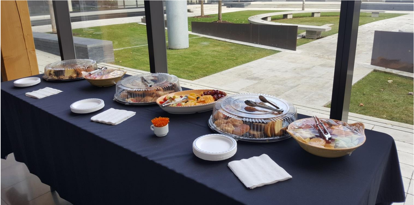
Breakfast refreshments prior to the Conference