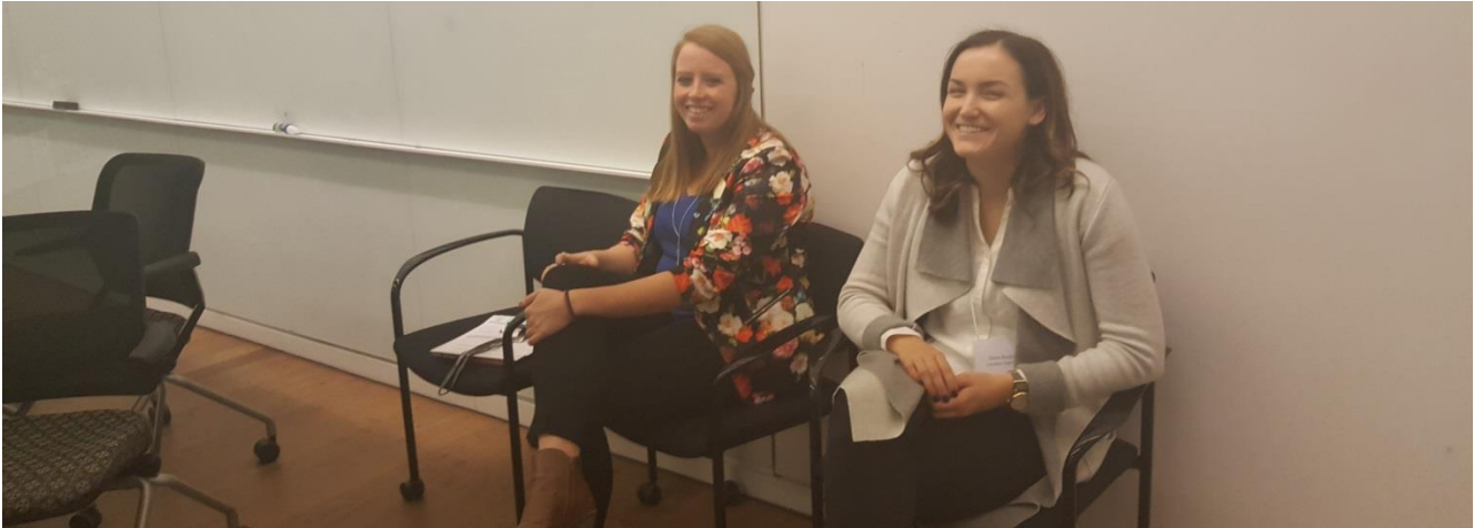
Balsillie School Volunteers and Canadian Red Cross Ontario IHL Unit Program Associate