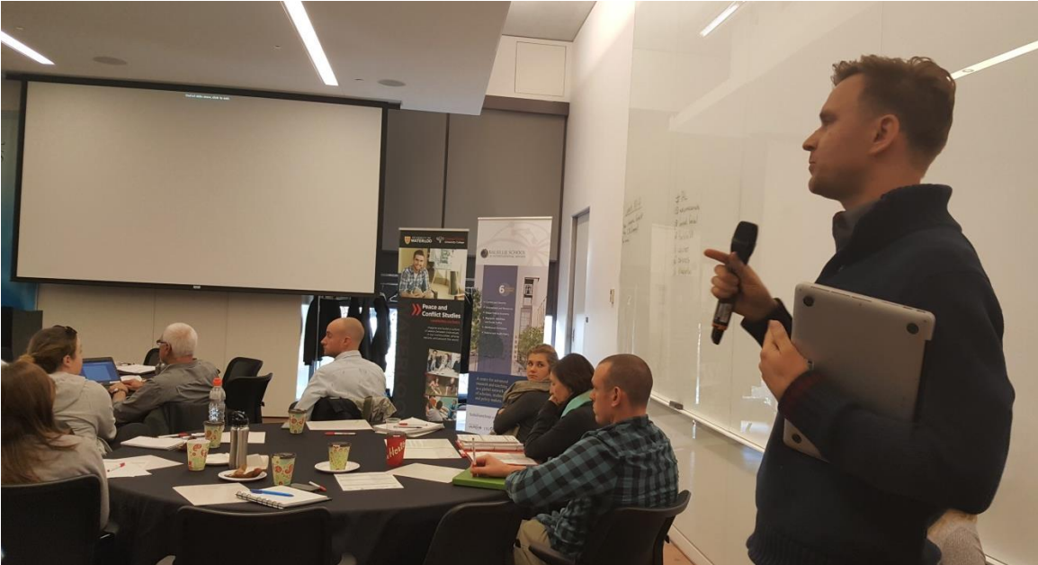
Questions from the Attendees