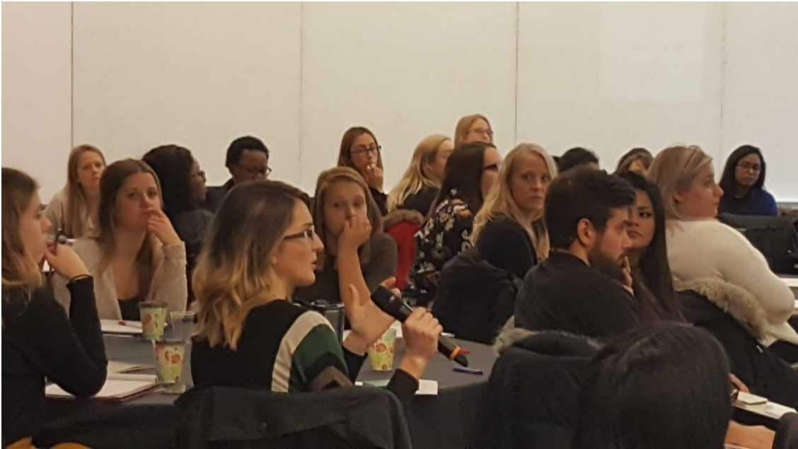
Questions from the Attendees